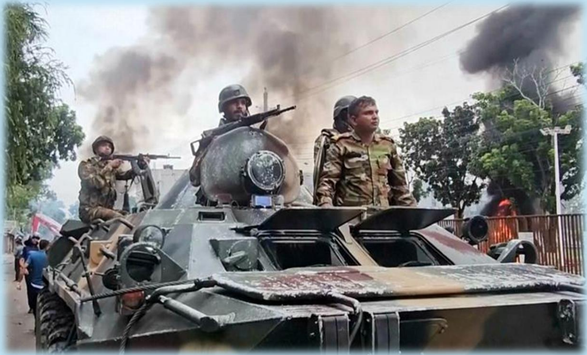
Photo: Army is using harsh repression to stop the general public in Gopalganj

Following this, security forces launched aggressive manhunts across Gopalganj, declaring curfew for indefinite period and conducting house-to-house raids. The Army, along with the RAB and police, committed gross human rights violations. Extrajudicial killings, arbitrary detentions, and inhumane torture were carried out. Law enforcement authorities confessed that they have arrested 90 people, although the real number will be much higher.