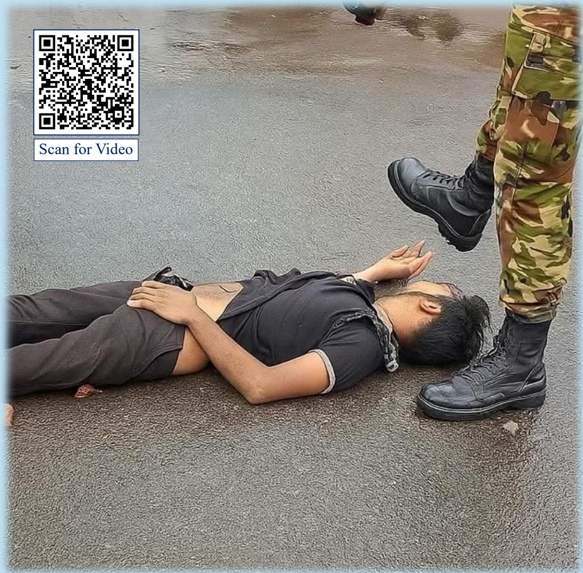
Video: Army soldier brutally hits head with boot, ensuring death ( click to watch video )

The people of Bangladesh demand full investigations into each killing and strict punishment for those responsible. They seek protection from state-sponsored terror, violence, and egregious violations of human rights.