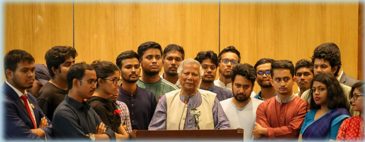
Photo: Chief Advisor to the Interim Government Dr. Yunus with NCP leaders

On August 5, 2024, following a major political shift, an interim government led by Dr. Yunus assumed power. Since then, the law-and-order situation in the country has drastically deteriorated. These incidents are largely attributed to state-sponsored actions by the unregistered student party National Citizens Party (NCP), along with Jamaat-e-Islami and the Bangladesh Nationalist Party (BNP).