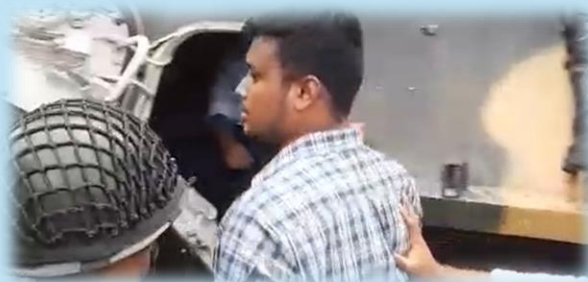
Video: NCP leaders being safely evacuated by APC ( click to watch video )