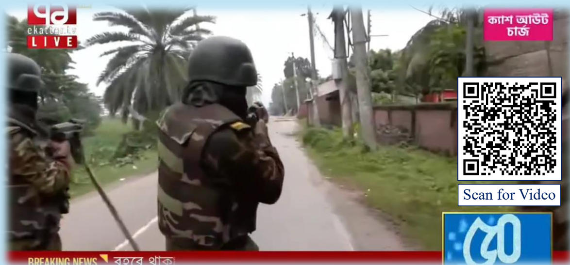
Video of Bangladesh Army firing lethal weapons ( click to watch video )

However, on July 16, law enforcement unleashed brutality. In an alarming incident, the Bangladesh Army used lethal weapons, killing four individuals, an act that has been reported in some media, though the exact death toll is suspected to be higher. The body of the four death people were buried or cremated without mandatory post mortem reports, police inquest certificates and death certificates. Another person died on 18 July 2025 at Dhaka Medical College hospital due to gun shoot injury. Nine others are fighting for their lives with bullet injuries, and approximately 50 people were injured.