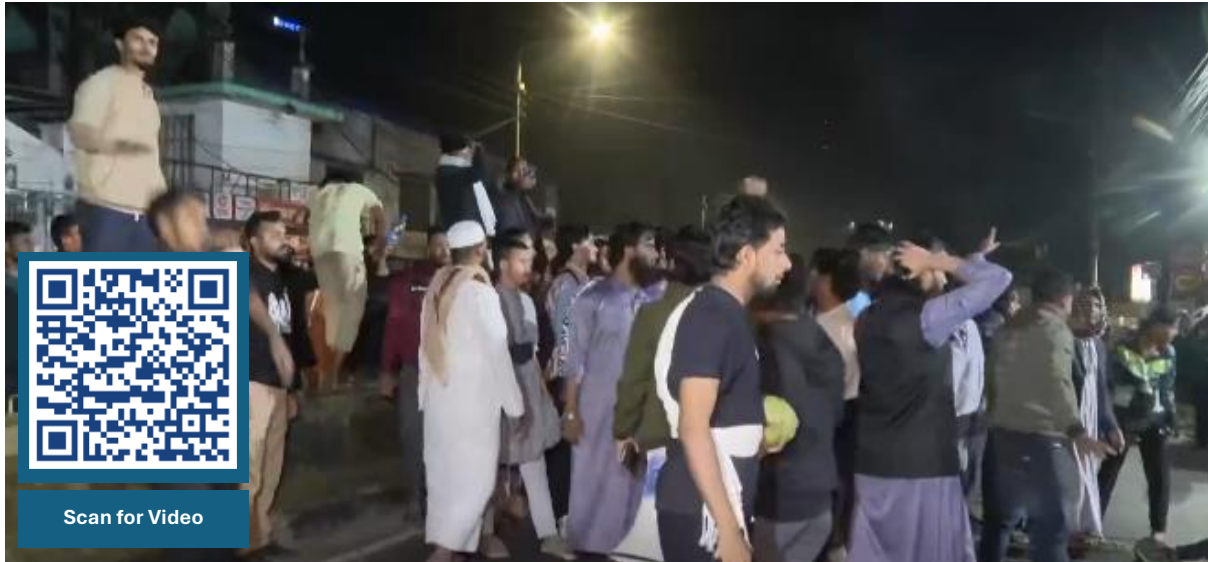
Extremists hurl bricks and stones at the Indian Assistant High Commissioner's residence in Chittagong.

On December 18, 2025, at 1:15 AM, extremists attacked the residence of the Indian Assistant High Commissioner in Chittagong [xlviii] . They started throwing bricks and stones at the High Commission office in the presence of the police .