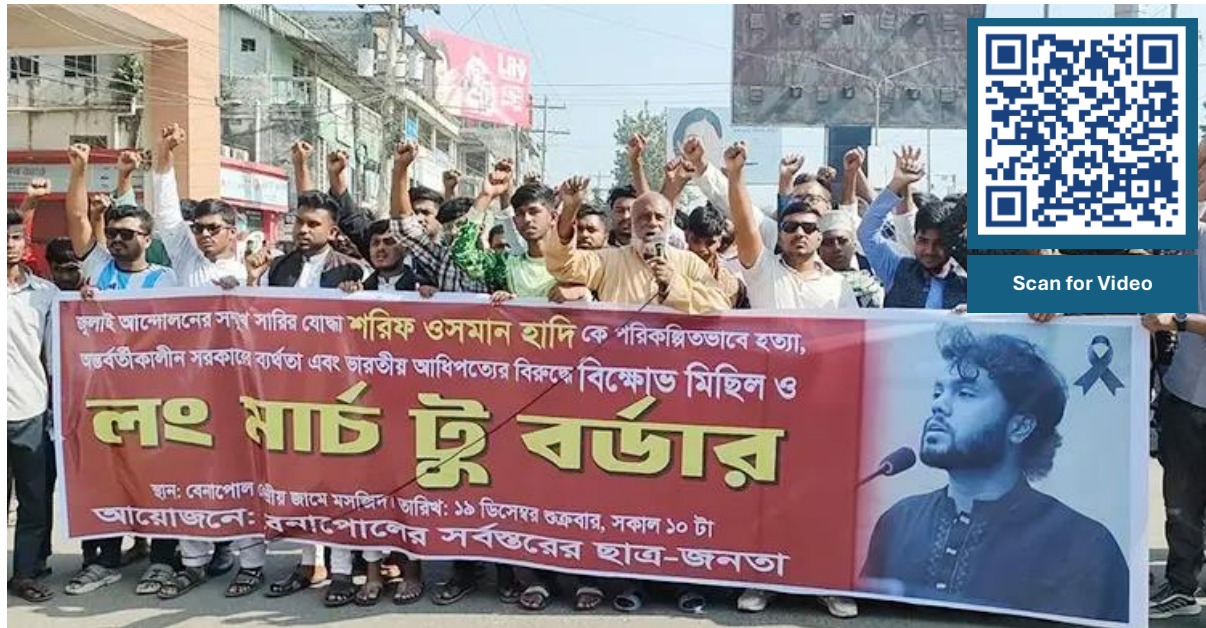
The gathering of the Long March to the Indian Border.