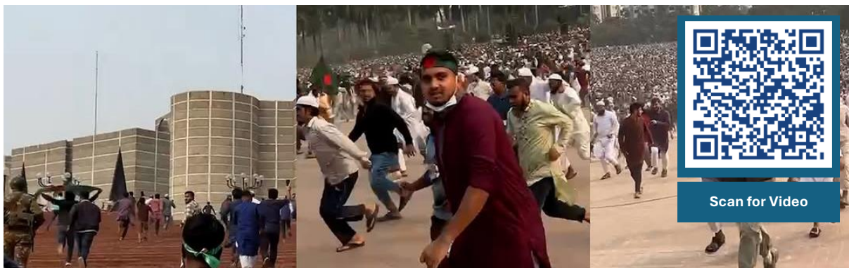
After Hadi's funeral, extremists attempted to enter the parliament by breaking through the barricades.

Following the funeral of Sharif Osman Hadi, a group of extremists attempted to enter the parliament building forcibly. Although law enforcement agencies, including the army, tried to stop them, they attempted to breach security barriers and enter the building. Earlier, on August 5, 2024, the parliament building was also subjected to extensive vandalism and looting [lxxxvii] .