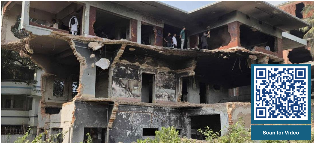
Following Hadi's death, 'Bangabandhu Bhaban' was once again vandalized and set on fire.

After the news spread of the death of Sharif Osman Hadi, the spokesperson of the Inqilab Manch, vandalism resumed at Dhanmondi Road 32. Around 12:40 AM on the night of December 18, 2025, a group of extremist miscreants attacked 'Bangabandhu Bhaban', a building steeped in the memories of Bangladesh's independence [xli] .