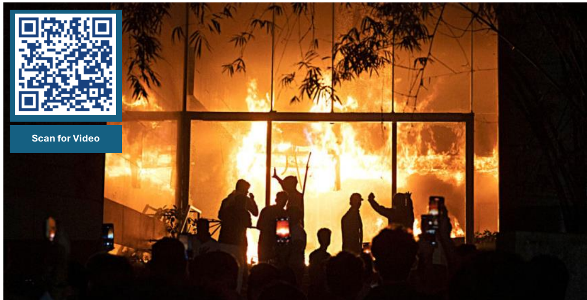
Arson attack on the Daily Star newspaper office.

The Daily Star office was also vandalised and set on fire immediately after the attack on the Prothom Alo office. At around 12 am on December 18, a group of 100 to 200 people broke through the main gate and entered the building's ground floor. They vandalised the furniture, the gallery, and the glass doors. At one stage, a pile of furniture and newspapers on the ground floor was set on fire. The fire spread to the third floor of the building [xxx].