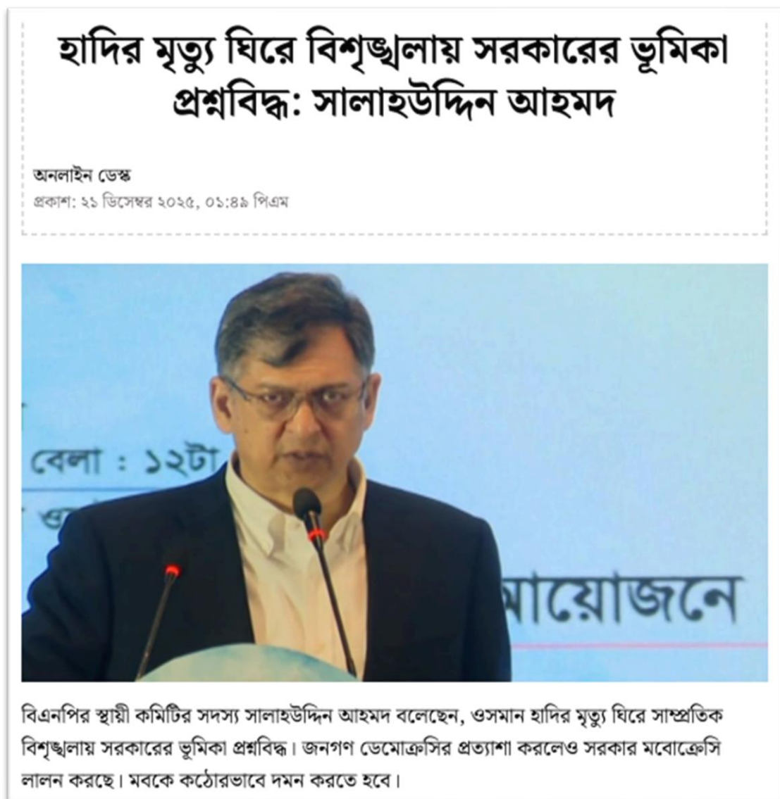
News report on the statement of BNP Standing Committee member Salahuddin Ahmed.

Following Sharif Osman Hadi's death and the deterioration of the law and order situation, the role of the government and law enforcement agencies has come under serious question. Salahuddin Ahmed, a member of the Standing Committee of the Bangladesh Nationalist Party (BNP), alleged that the current interim government is fostering mob rule [xxxv]. He claimed that the government's role in the attacks on two media outlets, despite having intelligence information, is questionable.