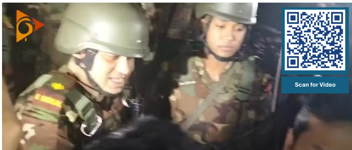
Video of the army arguing with the mob over asking for time.

As a result of the arson, 28 journalists including two female journalists were trapped inside the building. The attackers prevented the fire service and the army from rescuing them.