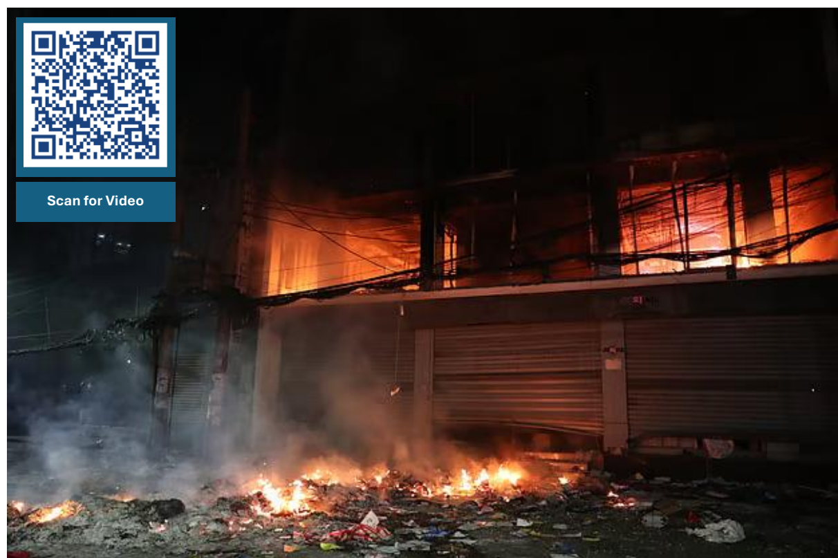
Prothom Alo's head office set on fire.