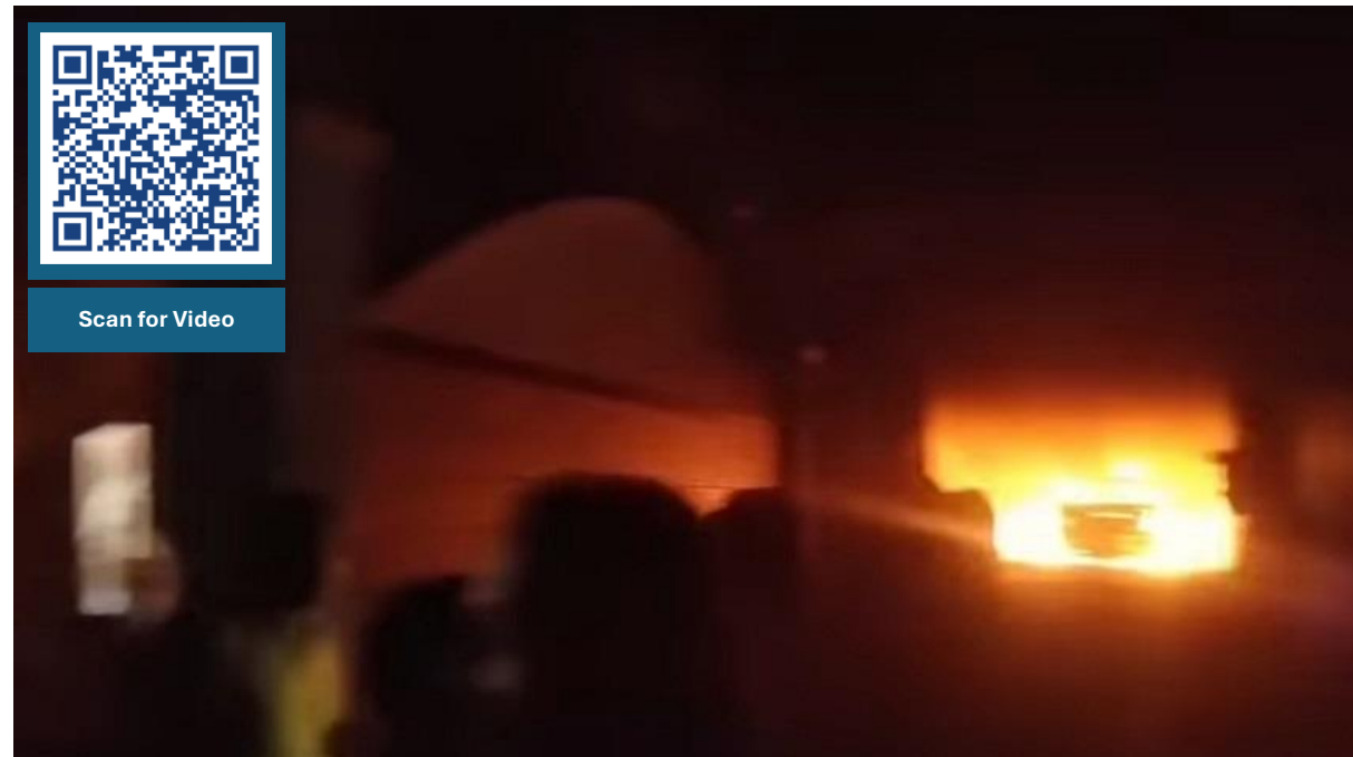
The ancestral home of former minister Barrister Anisul Islam Mahmud was set on fire and vandalized.

Extremists set fire to the ancestral home of former Foreign Minister and Chairman of a faction of Jatiya Party (JP), and head of the National Democratic Front (NDF), an electoral and political alliance of 18 political parties, and former minister Barrister Anisul Islam Mahmud [lxix] .