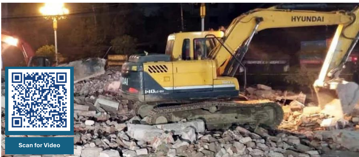
The Awami League office in Rajshahi was demolished with a bulldozer.

On the night of December 18, 2025, the Metropolitan Awami League office located in Kumarpura, Rajshahi city, was completely demolished with a bulldozer [lxxviii] .