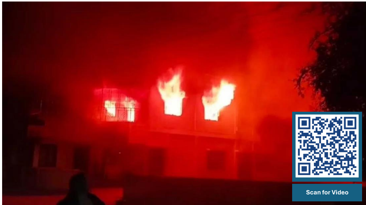
Vandalism and arson at the residence of former State Minister Khalid Mahmud in Dinajpur.

Police and local sources said that yesterday evening, a group of more than 100 people on motorcycles headed towards the minister's house while chanting slogans. They were wearing helmets. They had sticks and local weapons in their hands. At one point, they set fire to a pile of paddy straw in front of Khalid Mahmud Chowdhury's house. Later, the entire house was gutted by that fire [lxv].