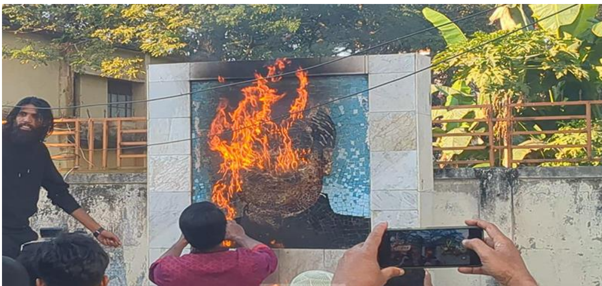
Habiganj District Awami League office vandalized and Bangabandhu's mural set on fire.

Students and the public protested in Habiganj, demanding justice for the murder of Sharif Osman bin Hadi. On Friday, they carried out a blockade program and a protest march in Habiganj town, attacking and vandalising the Awami League office [lxxxii] . The office was extensively vandalised, and a mural of Bangabandhu Sheikh Mujibur Rahman was set on fire [lxxxiii] .