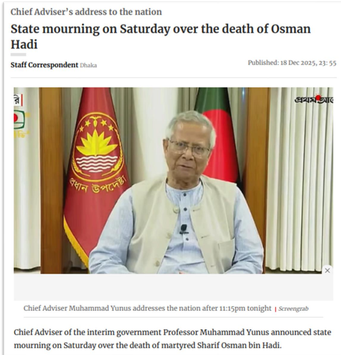
Chief Adviser's address to the nation.