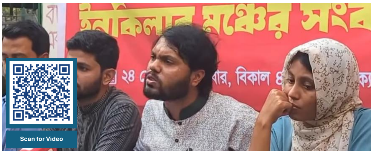
Video of a statement made publicly about vandalizing sculptures in exchange for money.

He publicly announced on a stage that it would cost 10 lakh taka to break sculptures [xix]. He also extorted money under the name of election campaigning. Videos of two separate individuals giving him money went viral on social media [xx]. After his death, inconsistencies were observed in the statements of one of the individuals who gave him money when questioned by a journalist, which clearly indicates his extortion activities [xxi].