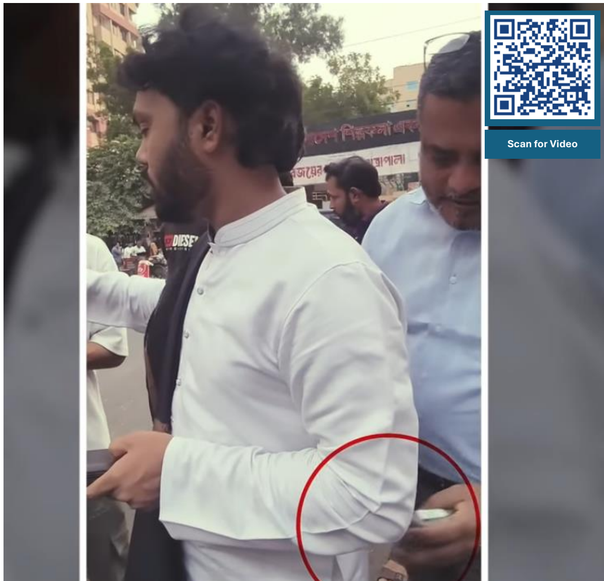
Video of money being put into Hadi's pocket.

Furthermore, Osman Hadi had taken crowdfunding assistance multiple times for fundraising. Separate videos of him receiving money have also gone viral on social media, and regarding one of these videos, which went viral after his death, a person, in response to journalists' questions, said that he was supposed to meet Osman Hadi the next day. Since he met him the day before, he gave him all the money he had [c]. He said they were supposed to meet again later. Although he did not directly accuse, his words suggest that Osman Hadi had asked him for a specific amount of money.