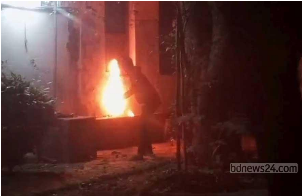
Miscreants torch the village home of International Crimes Tribunal prosecutor Zoha.

On the night of December 18, 2025, the house of International Criminal Tribunal prosecutor Tanvir Hasan Zoha in Magura was set on fire after petrol. The incident, which occurred in front of a sensitive area such as a judge's court, raised questions about security arrangements [vi] .