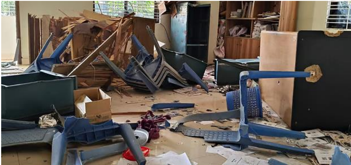
Attack and vandalism at the Prothom Alo office in Kushtia.

also attacked and vandalised, and several district offices were attacked [xxvii] . On the same day, the Prothom Alo office in Rajshahi was attacked, with its signboards vandalised, and its Bogra office was attacked at night. In addition, protests were held at Chittagong, Sylhet, Barisal, Chandpur, Munshiganj and Jahangirnagar universities and Prothom Alo activists were threatened and harassed [xxviii] .