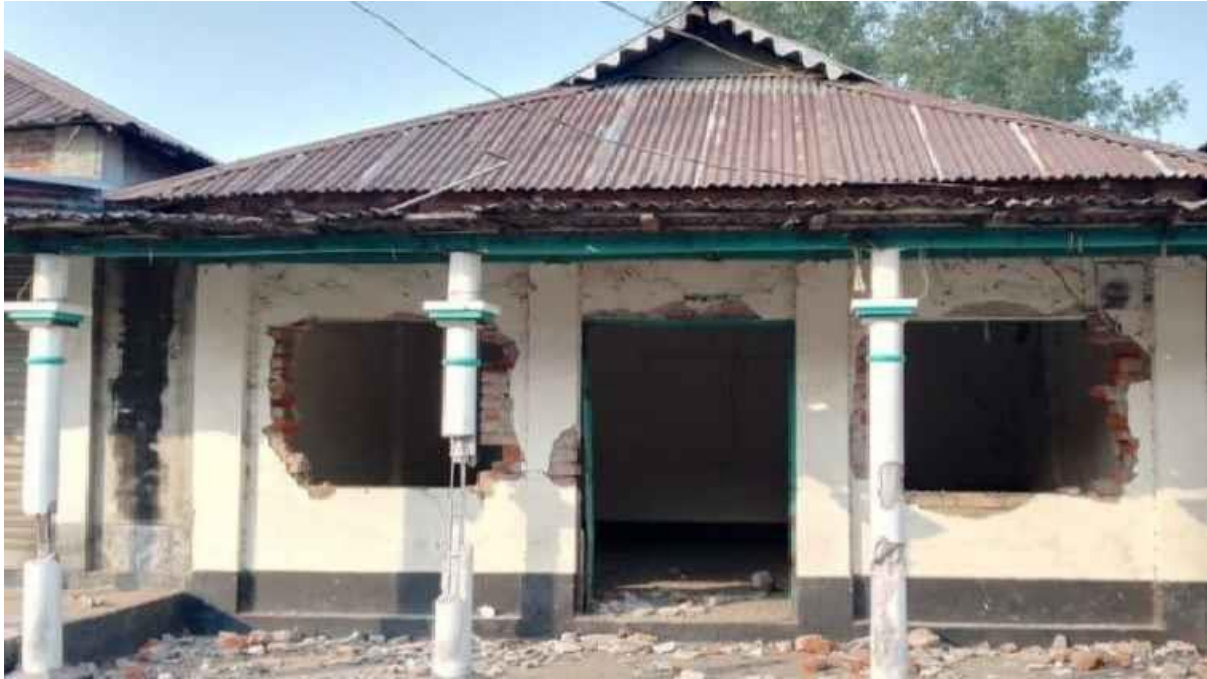
Saghata Upazila Awami League office vandalized.

Following the death of Sharif Osman bin Hadi, extremists also carried out vandalism in Saghatta Upazila of Gaibandha. On Friday (December 19), they vandalised the office of the Saghatta Upazila Awami League in Ullabazar [lxxxiv] . Furniture, banners, and other office materials were damaged in the incident.